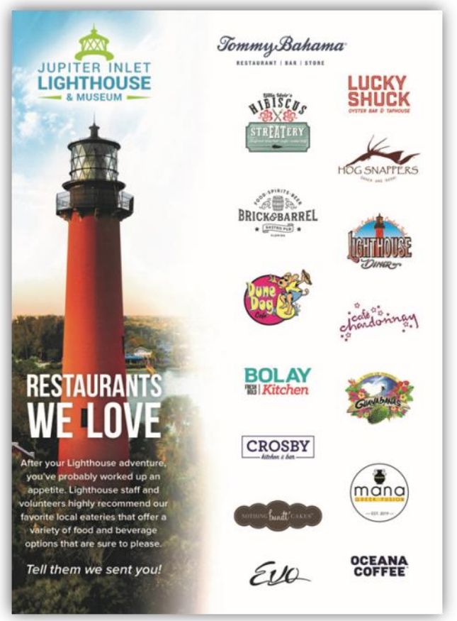
'The ' Restaurants We Love' promotional card is handed out to hundreds of Lighthouse visitors per day.

Loxahatchee River Historical Society, 500 Captain Armour's Way, Jupiter, FL 33469 Phone: 561-747-8380 x 100 Website: <u>www.jupiterlighthouse.org</u> Email: RendezvousLighthouse@gmail.com