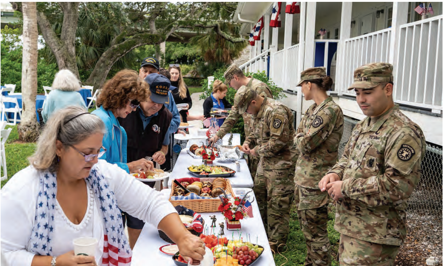
Active duty soldiers from local recruiting companies serve breakfast to veterans and their families.