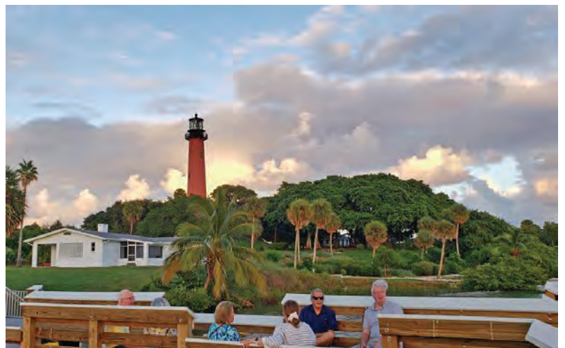
A dusk sky and the lighthouse provided a wonderful backdrop for the award presentation and a docent social.

We love our volunteers! Join our team of dedicated docents & be part of the effort to preserve our nationally significant history. Learn more and apply: http://bit.ly/JILMVolunteer