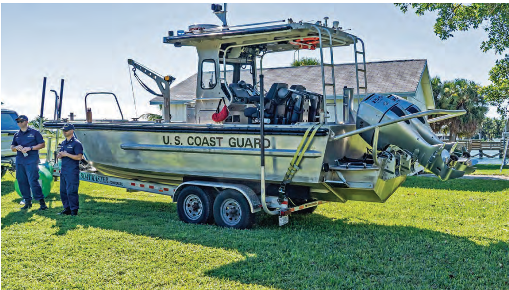
20-foot tender from the Fort Pierce Aids To Navigation Team. Boats like this are used by the Coast Guard to maintain minor aids to navigation such as channel markers and small buoys, a responsibility dating back to their predecessors in the Lighthouse Service.