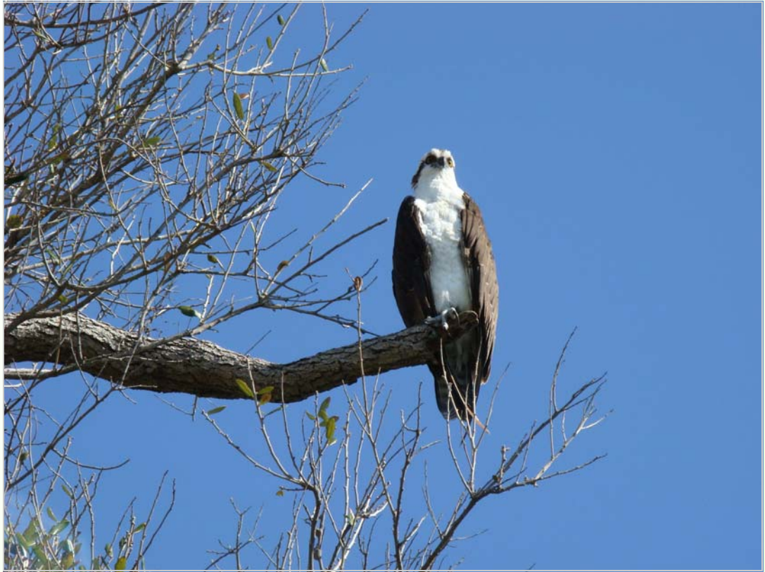
Osprey above, Ibis below