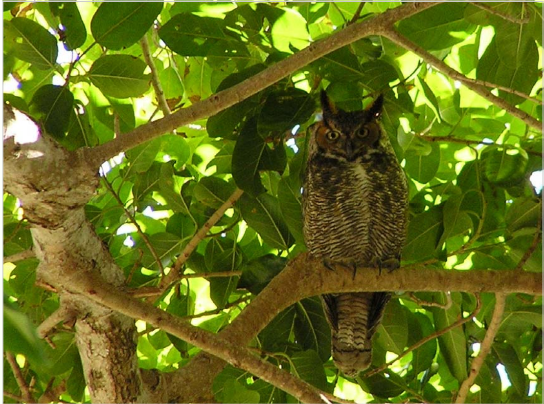
“Winkie” the Lighthouse Great Horned Owl Great Egret and Snowy Egret